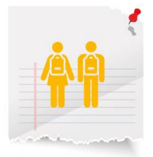
School - Classes 3rd & above and College Students