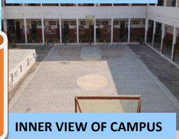
INNER VIEW OF CAMPUS