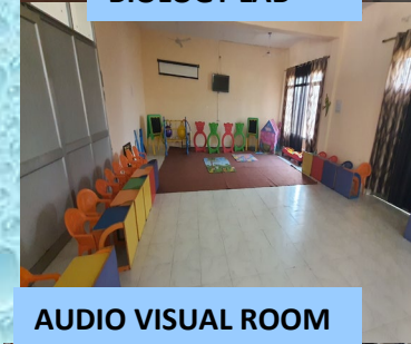
AUDIO VISUAL ROOM