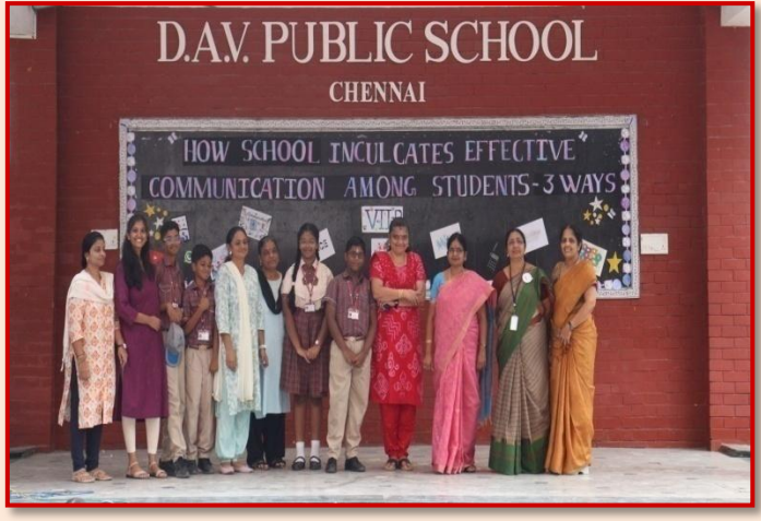
Parents applaud the Work of the Students