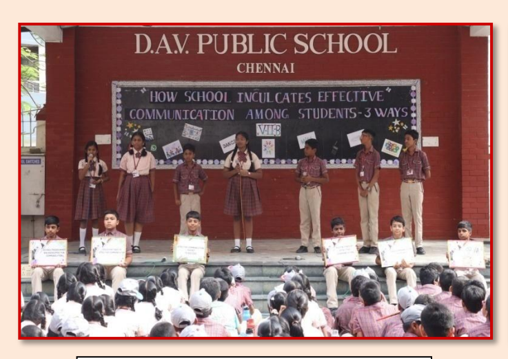
Talk Show on Evolution of Communication