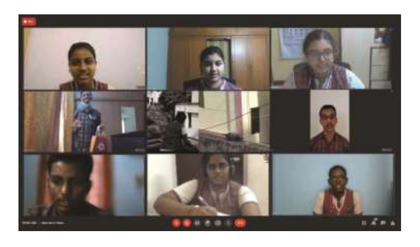
A Skit on How School fosters Human Excellence through Conscience during the Pandemic.