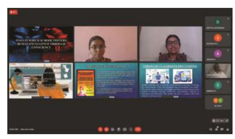
A Presentation on the various initiatives taken by the School to instil Conscience among students