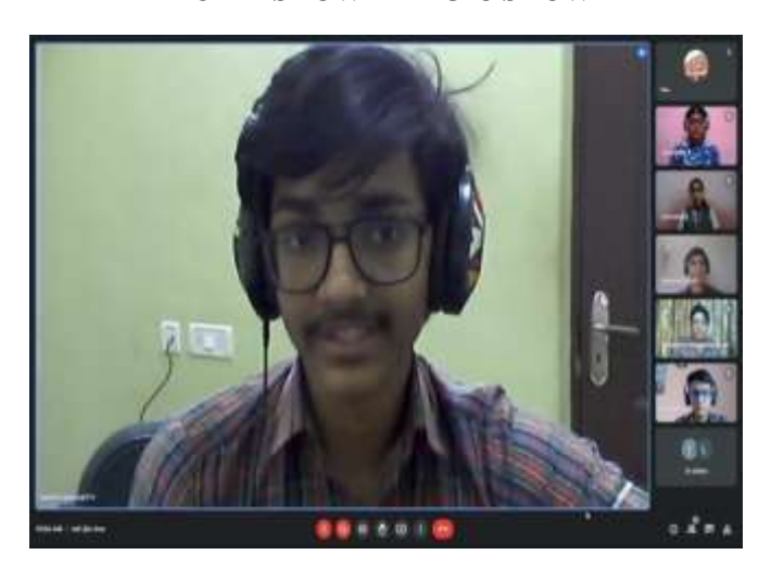
TIYUSAISHI - DEBATE on "Competition enhances Competence"