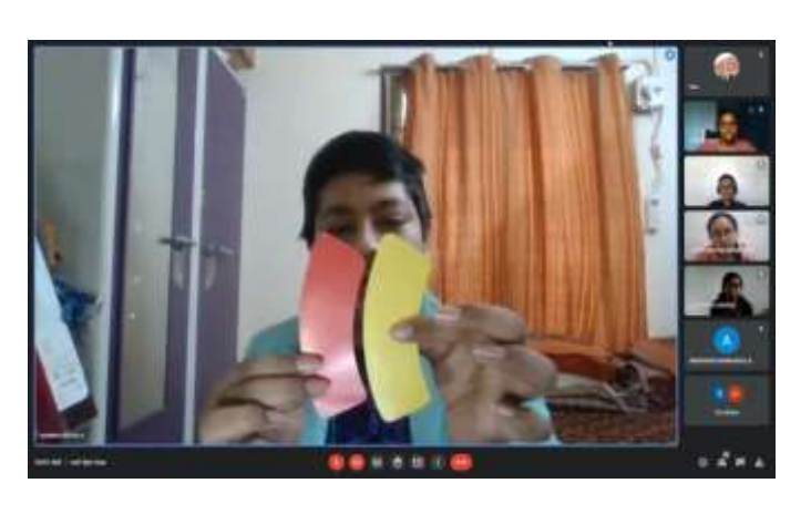
ZAUBERSHOW – MAGIC SHOW