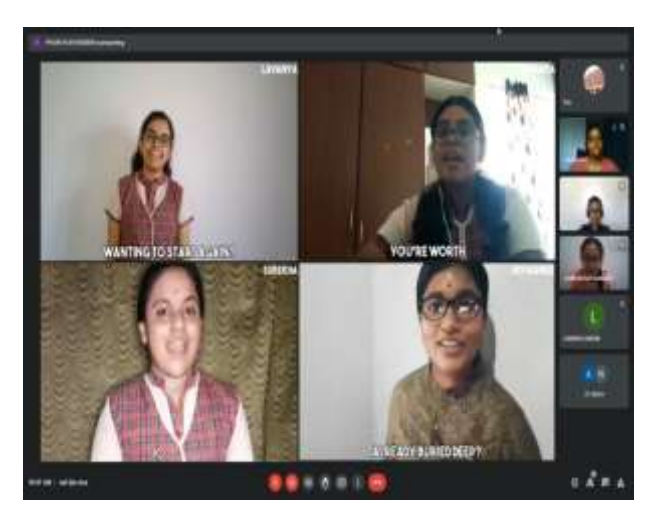
ENCHANTANT – Showcasing Musical Intelligence