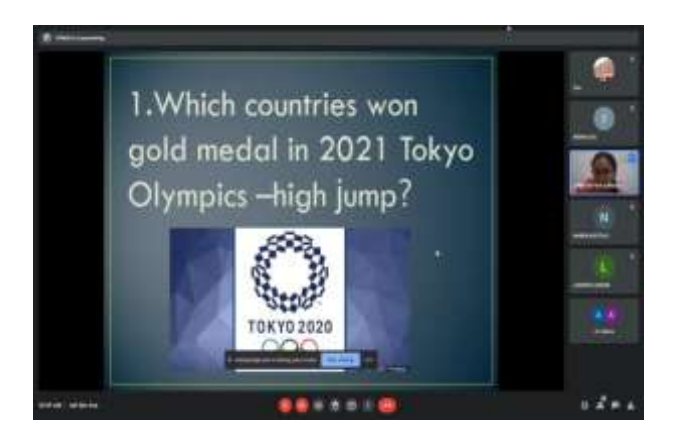
KWIJEU – QUIZ SHOW