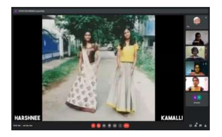
DANZA – Dance by Kinaesthetically Intelligent Students