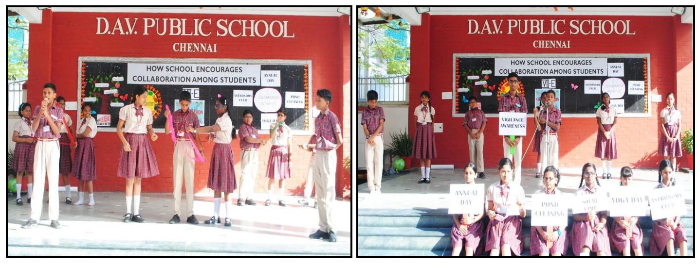
A Skit to show Collaboration in Real Life