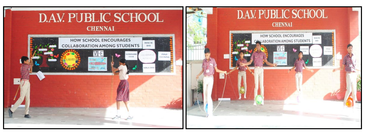
Martial Arts & Skipping - Demonstration of Collaboration