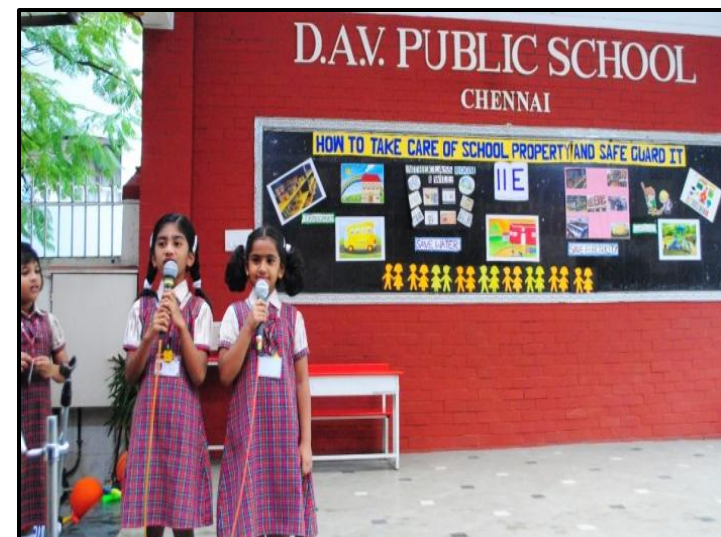
Importance of Safeguarding School Property – Our view