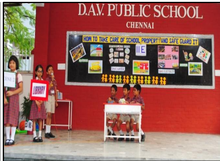
'My School , My Property' - Skit