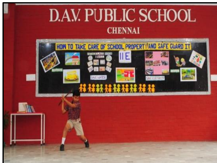
Silambam – A Traditional Art