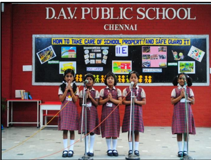
Seeking the Blessings of the God