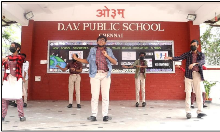
Enthralling Dance Performance