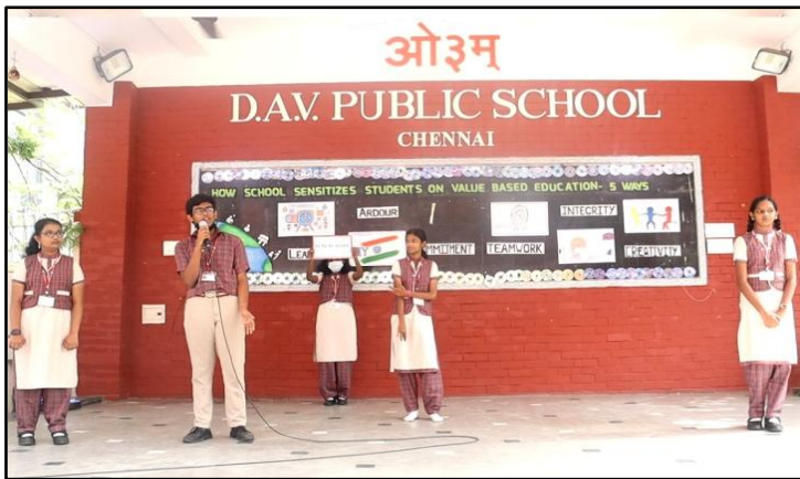
Quiz on Indian Virtue of Vasudhaiva Kuttumbakkam