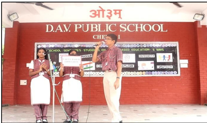
Ethics of Righteousness and Reitude