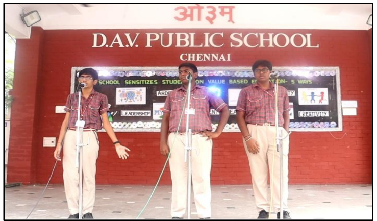
Tinges of the theme