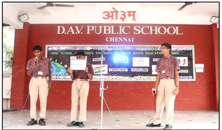
Quintessence of the day on Value Based Education