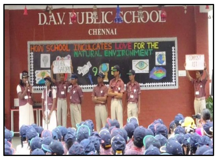
Skit - Initiative Taken by School for Clean Environment