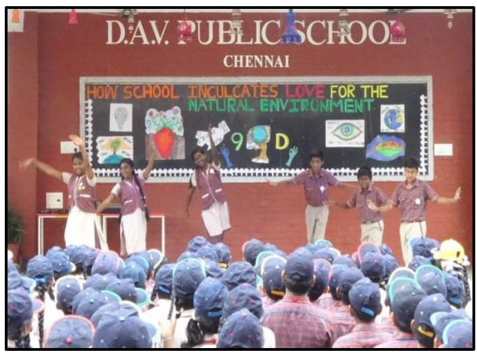
Dancers Enjoying the Beauty of Nature