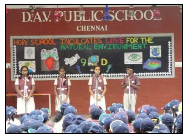
Holy Sayings - Love For Environment